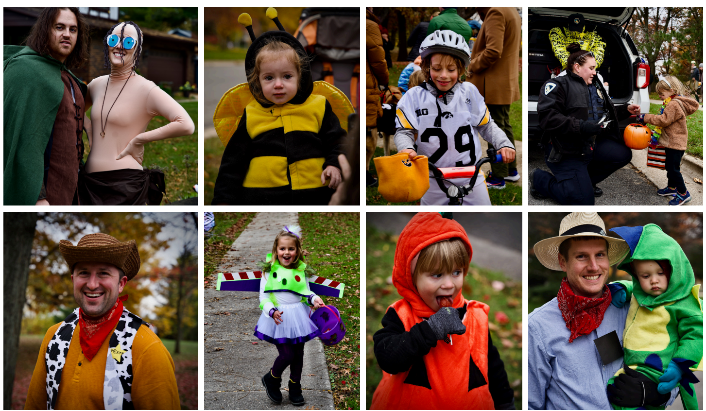
The neighborhood gathered for a Halloween parade followed by a Trunk or Treat at Arbor Hills Park